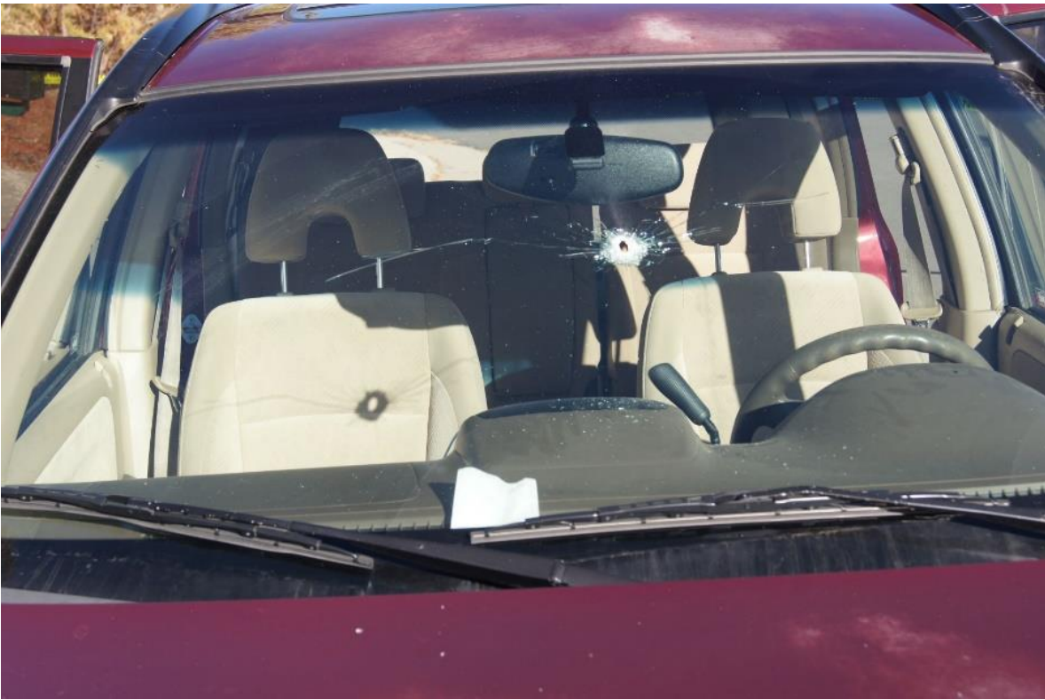
A black cell phone and a blue cell phone case were recovered in the backseat and cargo area of the CRV.